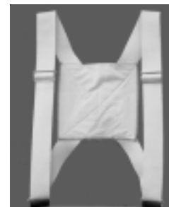
Heavy Duty Comfort Harness Fits Bag or Bucket