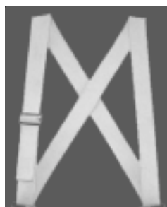
Standard 96" Strap Included with all Bags and Buckets