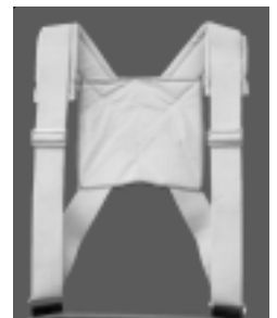
Heavy Duty Padded Comfort Harness Fits Bag or Bucket