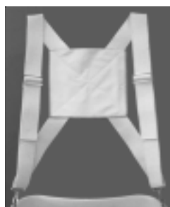
Deluxe Cherry Harness (2" Cotton Webbing) For Cherry/Olive Bucket